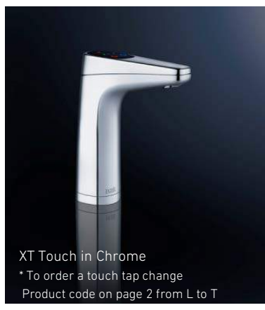
XT Touch in Chrome

Billi Quadra units are available with a choice of XL Levered, XT Touch & XR Remote dispenser styles in a range of finish options including Chrome, Matte Black, Matte White & Rose Gold.