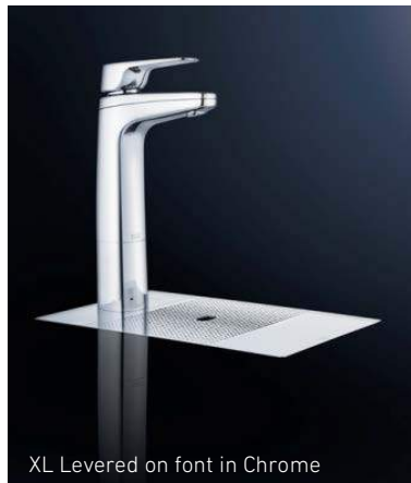
XL Levered on font in Chrome

Instant boiling & chilled filtered drinking water systems